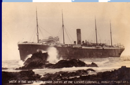
SS Suevic Aground on the Lizard

The SS Suevic was on passage from Australia to Southampton with a general cargo when she ran onto the Maenheere Reef in dense fog and a strong south westerly gale. The signals of distress were quickly responded to by RNLI lifeboats from The Lizard, Cadgwith, Coverack and Porthleven. The Mullion lifeboat was also alerted but did not attend. In heavy seas, the RNLI volunteers rowed out time and time again to rescue hundreds of men, women and children. It took them almost 16 hours and, as a result of the bravery and determination of the volunteer crews, six silver RNLI medals were subsequently awarded.