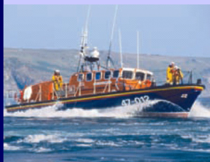
Tyne Class Lifeboat

The Arun class lifeboat based at Calshot lifeboat station was withdrawn from service on Sunday 4 February 2007 after 17 years of service in the RNLI fleet. Calshot's Arun, named the Mabel Williams , was the last such vessel in the RNLI's fleet. This has been replaced by a Tyne class lifeboat, ON 1155, named the ' Sarah Emily Harrop ', which was built in 1989, and previously served as Lytham St Anne's lifeboat and more recently in the RNLI's relief fleet. The ' Mabel Williams ' - ON 1159 - had been on service at Calshot since 2004, and before that they had an Arun called the ' Margaret Russell Fraser ', which boat had