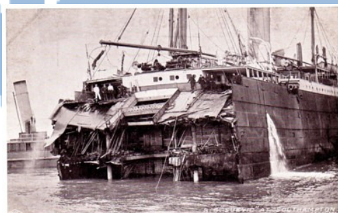
SS Suevic's stern section in Southampton Docks