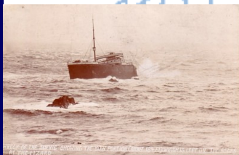
SS Suevic's bow section left on the Lizard