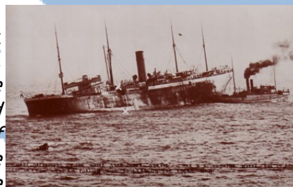
SS Suevic being cut up by salvage teams