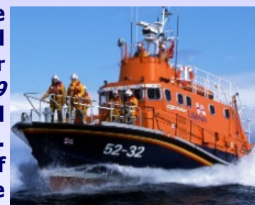
Arun Class Lifeboat